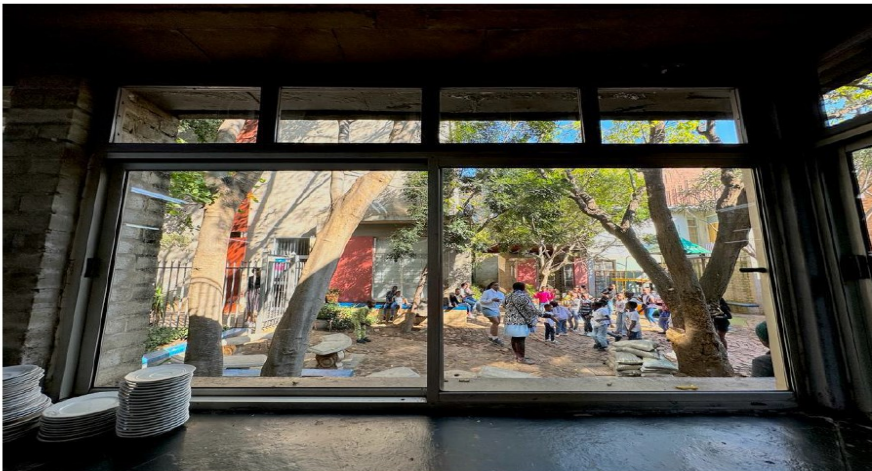
PHOTO: Life at The Potter's House, a shelter for abused women and their children at Tshwane Leadership Foundation, is always bustling with activity.

building teams, equipping leadership, empowering families | June 2023