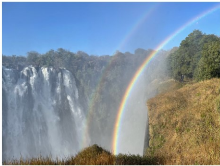
Victoria Falls ~ A wonder of the natural world

We have been in Zambia for almost two years, as the renewal process for our immigration paperwork reminds us. It is a long time to be away from family and friends in North America, but some visits over the past year have helped lessen the feeling of distance.