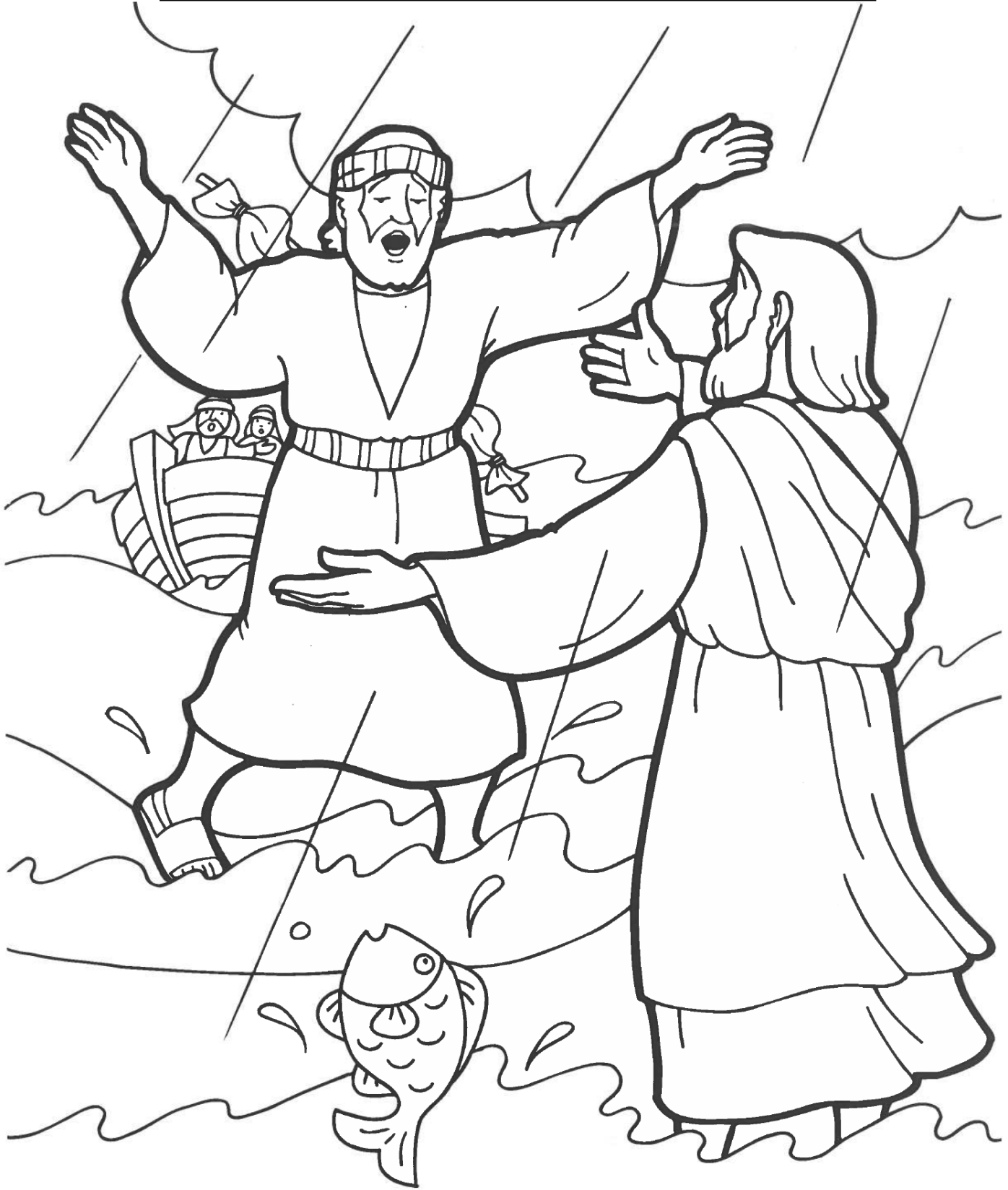
Jesus walks on the water and helps His friends.

Matthew 14:22-33; Mark 6:45-52; John 6:16-21