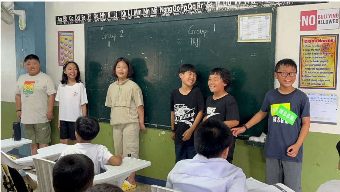
Making new friends in a classroom in the Philippines