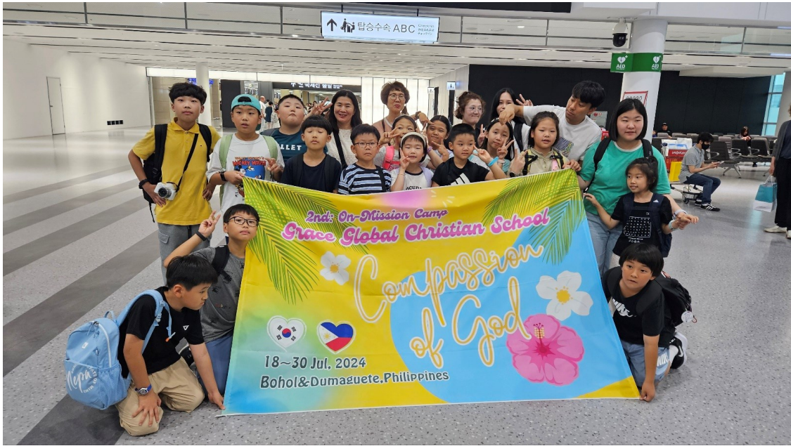
Getting ready to leave!