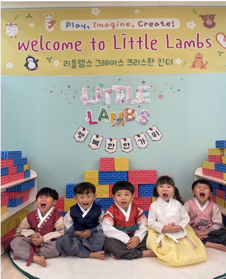
Welcome to Little Lambs