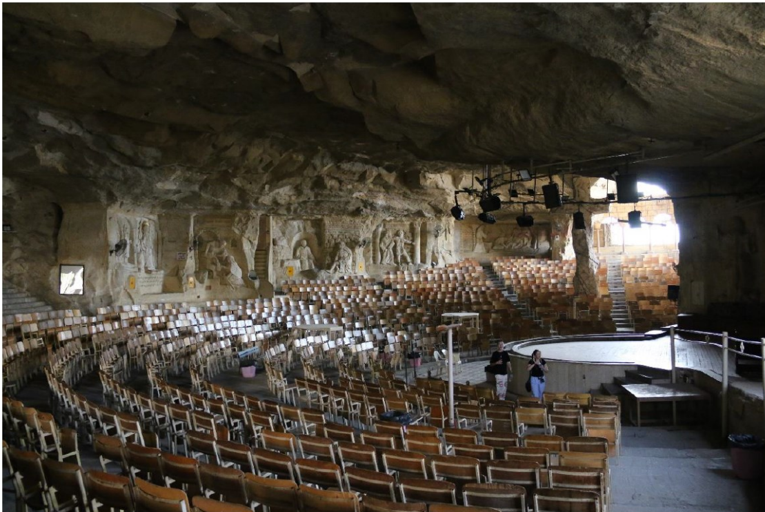
PHOTO: There were so many highlights from our time in Luxor and Cairo, Egypt in March. One of them was our tour of the Cave Churches in Garbage City . It was inspiring to see what can happen when Christians come together even amidst the most challenging circumstances.

building teams, equipping leadership, empowering families | sept 2024