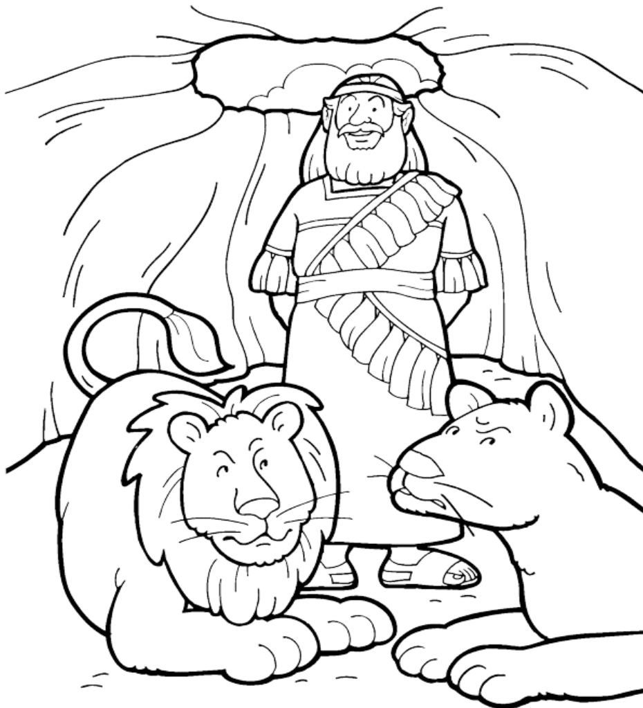
God protects Daniel in a den of lions. Daniel 6:1-28

© 1997 by Gospel Light • Reprinted by permission of Gospel Light • Bible Story Coloring Pages • 126