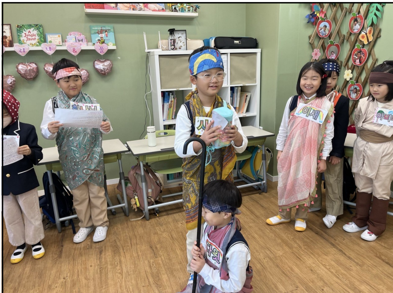
Some of our first and second graders presenting the Christmas story for chapel

There is something I noted this year. The passages we read in the Christmas season seem to place side by side God’s faithfulness to his past covenant promises and his often surprising, unexpected ways of fulfilling those same promises. You might even conclude that God specializes in fulfilling promises when the future appears to be the darkest. And not only that. God seems to use the most unlikely people to fulfill his promises.