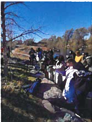
Easter at the Riverside