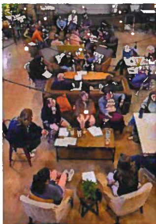
A recent Sunday Feast